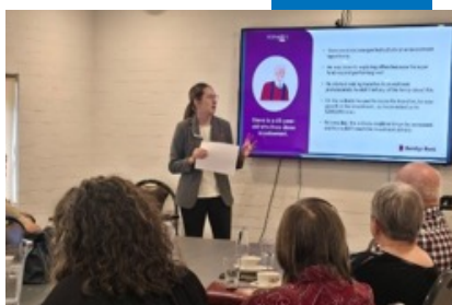
Banking Safely Online sessions delivered to various community groups