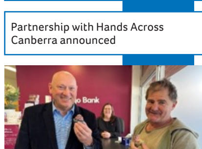
Partnership with Hands Across Canberra announced