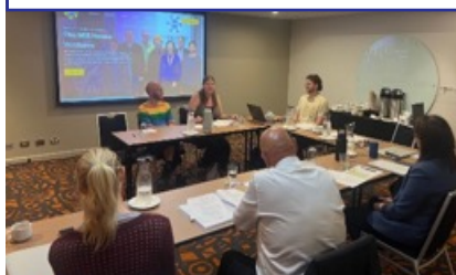
ACT Social Enterprise Grants panel sits