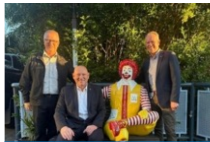
Visit to the Quiet Room at Ronald McDonald House, Newcastle, which we fund